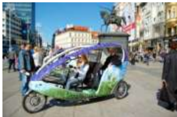
Exhibition in the main square in Zagreb