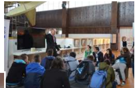
Technical museum in Zagreb